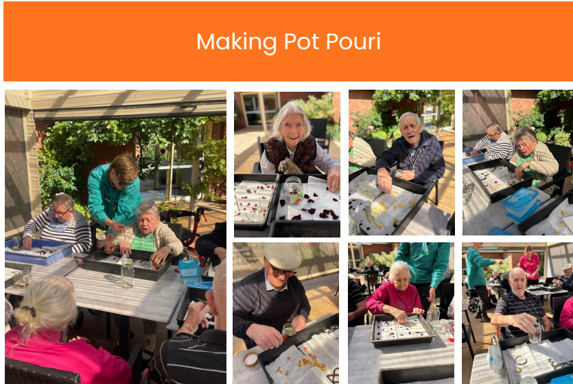
Making Pot Pouri