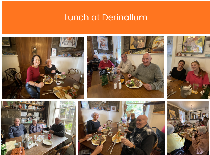
Lunch at Derinallum